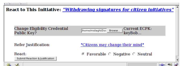
Figure 2: Bob supports the initiative.

Let citizen Alice have a new initiative: "Citizens should be allowed to withdraw their signatures for citizen initiatives!". To promote this idea she initiates the following process.